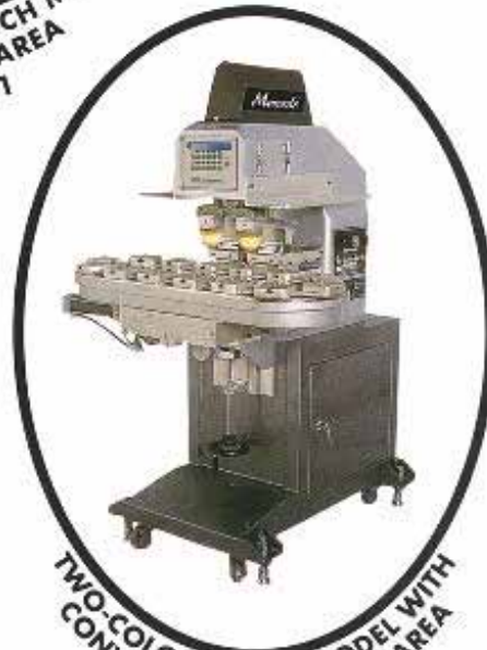
TWO-COLOR FLOOR MODEL WITH CONVEYOR, 3 X 3 IMAGE AREA MO-100-2

A WHOLE NEW WAY OF MARKING A WHOLE NEW WAY OF MARKING A WHOLE NEW WAY OF MARKING