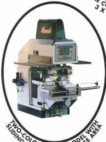
TWO-COLOR BENCH MODEL WITH SLIDING SHUTTLE, 3 X 3 IMAGE AREA MO-100-2