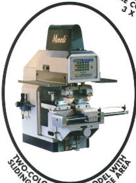
TWO-COLOR BENCH MODEL WITH SLIDING SHUTTLE, 3 X 3 IMAGE AREA MO-100-2