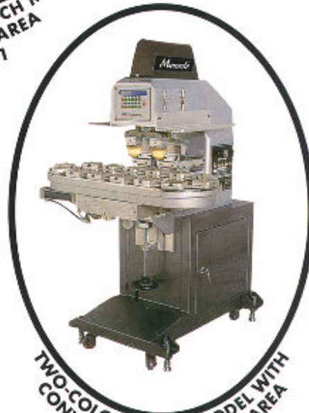
TWO-COLOR FLOOR MODEL WITH CONVEYOR, 3 X 3 IMAGE AREA MO-100-2

A WHOLE NEW WAY OF MARKING A WHOLE NEW WAY OF MARKING A WHOLE NEW WAY OF MARKING