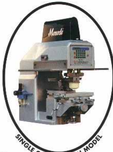
SINGLE COLOR BENCH MODEL 3 X 6 IMAGE AREA MO-100-1