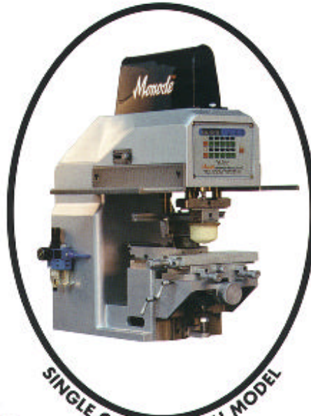
SINGLE COLOR BENCH MODEL 3 X 6 IMAGE AREA MO-100-1