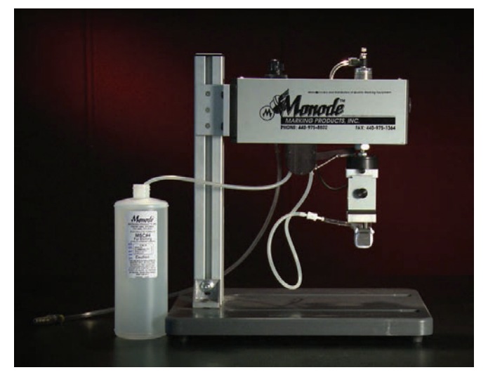
The world leader in etching technology Semi automatic marking