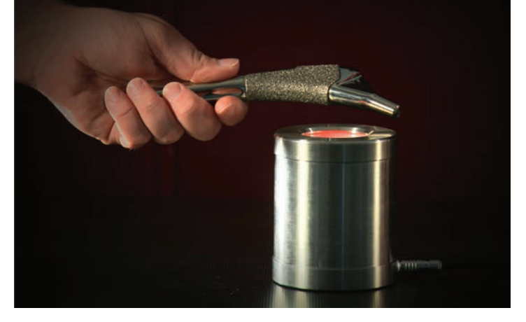
Standard and custom machine vision solutions