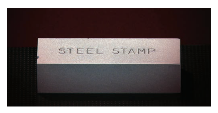
Full line of standard and custom steel stamps