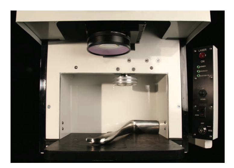
The industry born marking laser