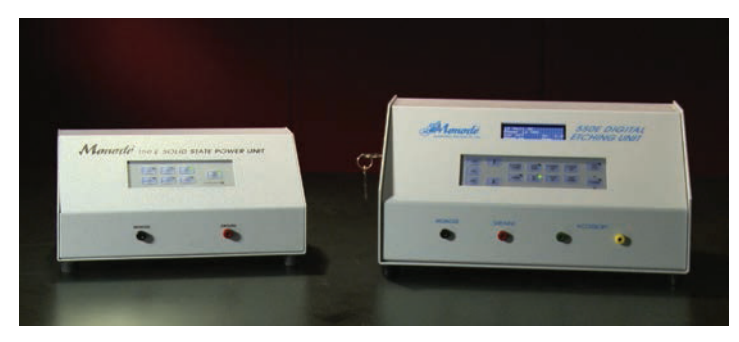
Electrochemical Etching - Power Units